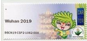
Special labels produced with transparent backing paper (film)