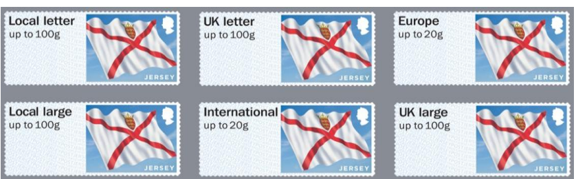
Illustration & Design: True North