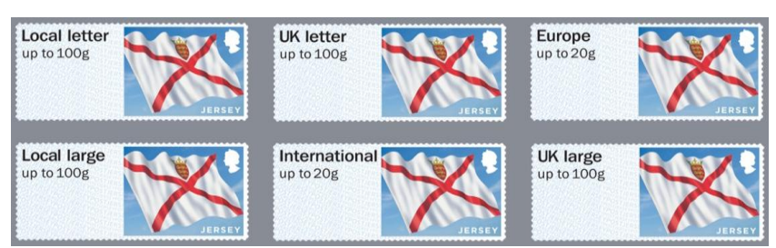
Illustration & Design: True North