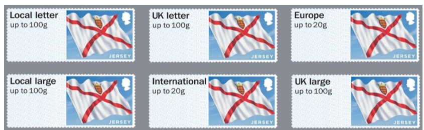
Illustration & Design: True North