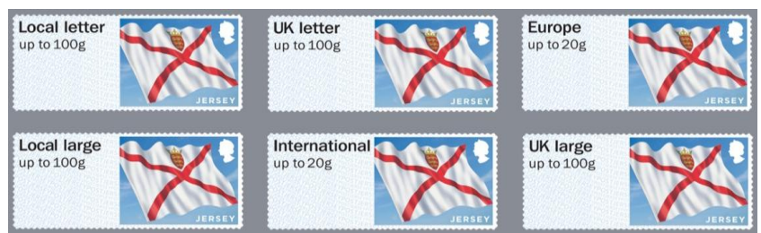
Illustration & Design: True North