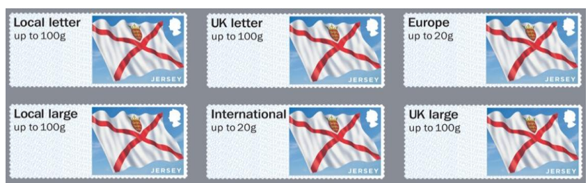
Illustration & Design: True North