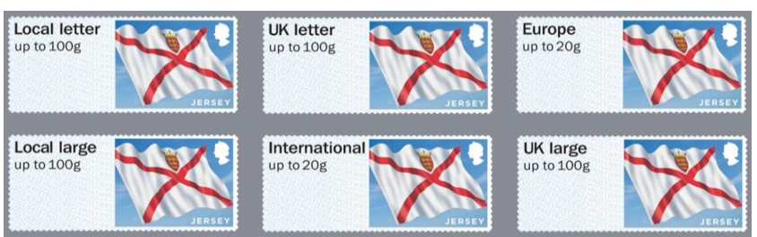
Illustration & Design: True North