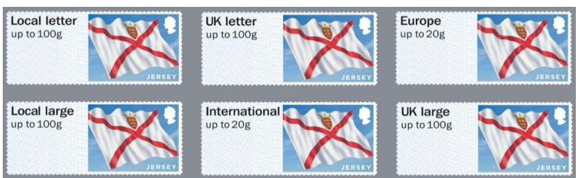
Illustration & Design: True North