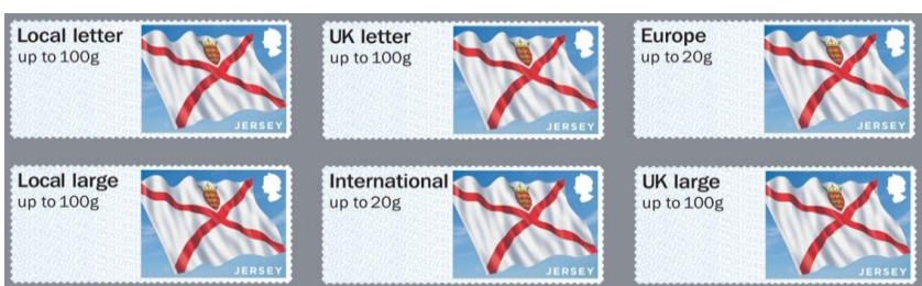
Illustration & Design: True North