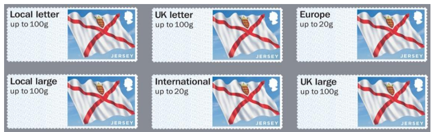
Illustration & Design: True North