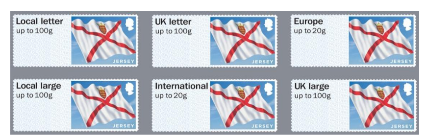
Illustration & Design: True North